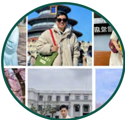
ULISERS and the journey in China