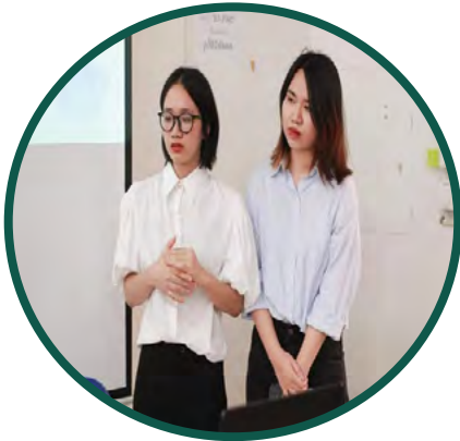
ULIS students won high prize at the contest “#TeamUp-ForClimate Challenge”