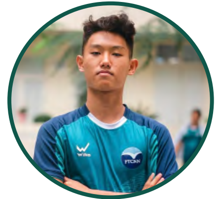
FLSS student with an absolute SAT score secured a 7-billion-VND scholarship