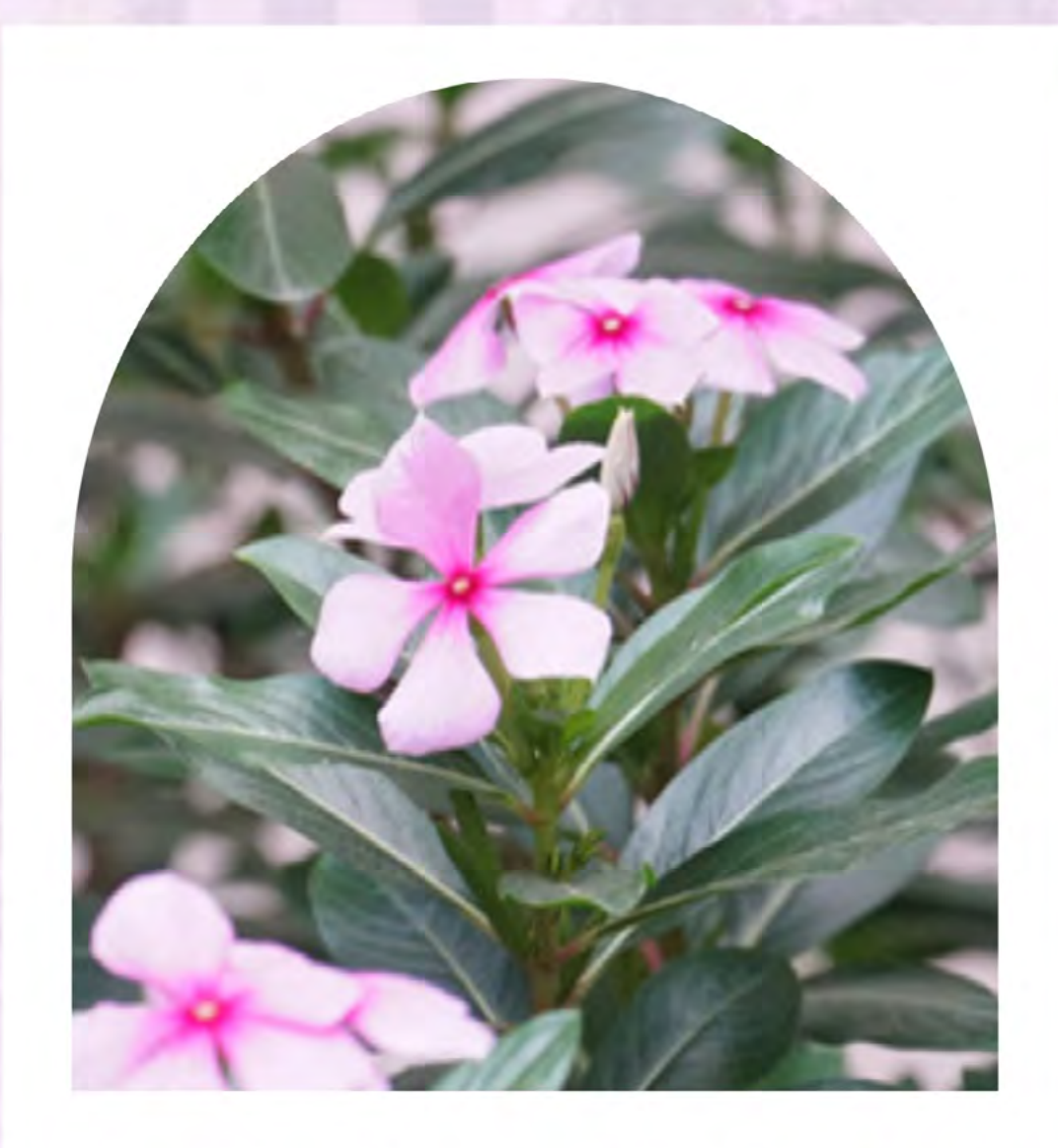
Creating Opportunities Together!